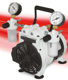
One-head w/controller, gauge

Known world-wide for speed, ease of use and long service intervals