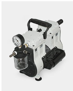
Models 2581/.2585 w/ Catch-pot & Regulator