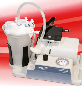
Filter/Aspiration Collection System