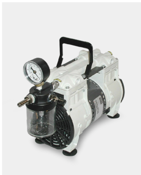
Models 2561/2567 w/ Catch-pot & Regulator