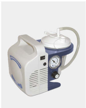
Model 2511 Aspirator