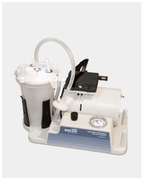
Model 2515 Aspirator