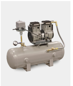
Model 8150 on 10 gal tank