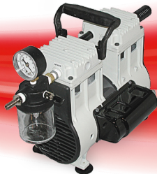
Two-head w/controller, gauge