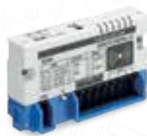
Wireless system EXW1 Series