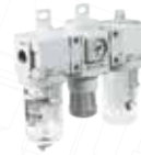
FRL combination units AC-D Series