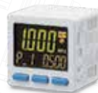
High-precision digital pressure switch ISE20 Series