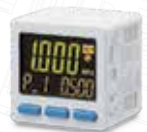
High-precision digital pressure switch ISE20 Series