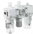
FRL combination units AC-D Series