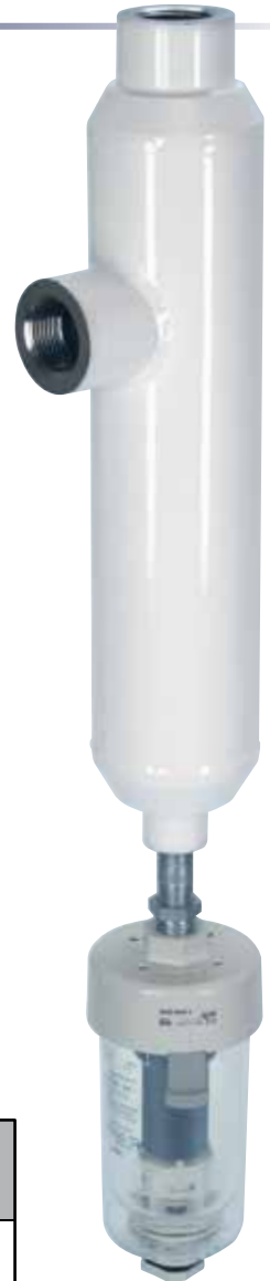
Shown with AD402-A Auto Drain