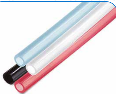
TH/TH Series FEP Tubing