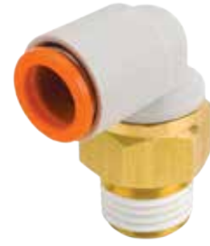
KQ2 Series One-touch Fitting