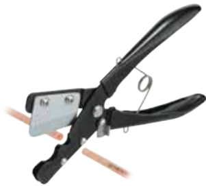
TK6 Series Tube Cutter