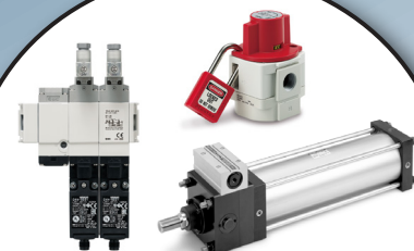
SAFETY RELATED PRODUCTS