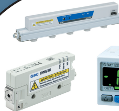
STATIC NEUTRALIZATION EQUIPMENT