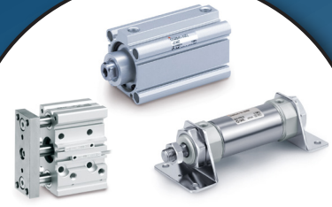
DUST RESISTANT CYLINDERS