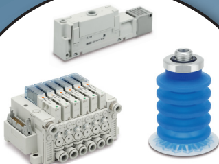
VACUUM EJECTORS AND CUPS