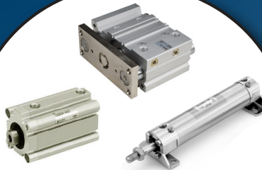
WATER RESISTANT ACTUATORS