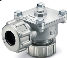
PULSE VALVE FOR DUST