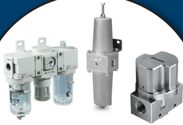
AIR PREP PRODUCTS (F.R.L.)

Components for Food and Beverage Packaging