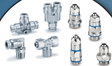
STAINLESS STEEL & HYGIENIC FITTINGS